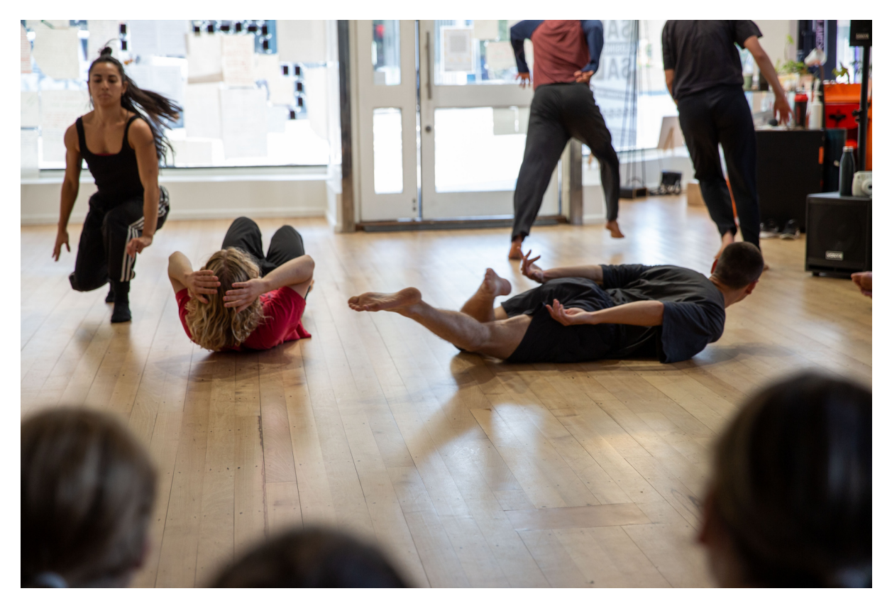
Feeling lost? Perhaps an authentic movement class to RE-CENTRE, RE-CALIBRATE & RE-CHARGE.