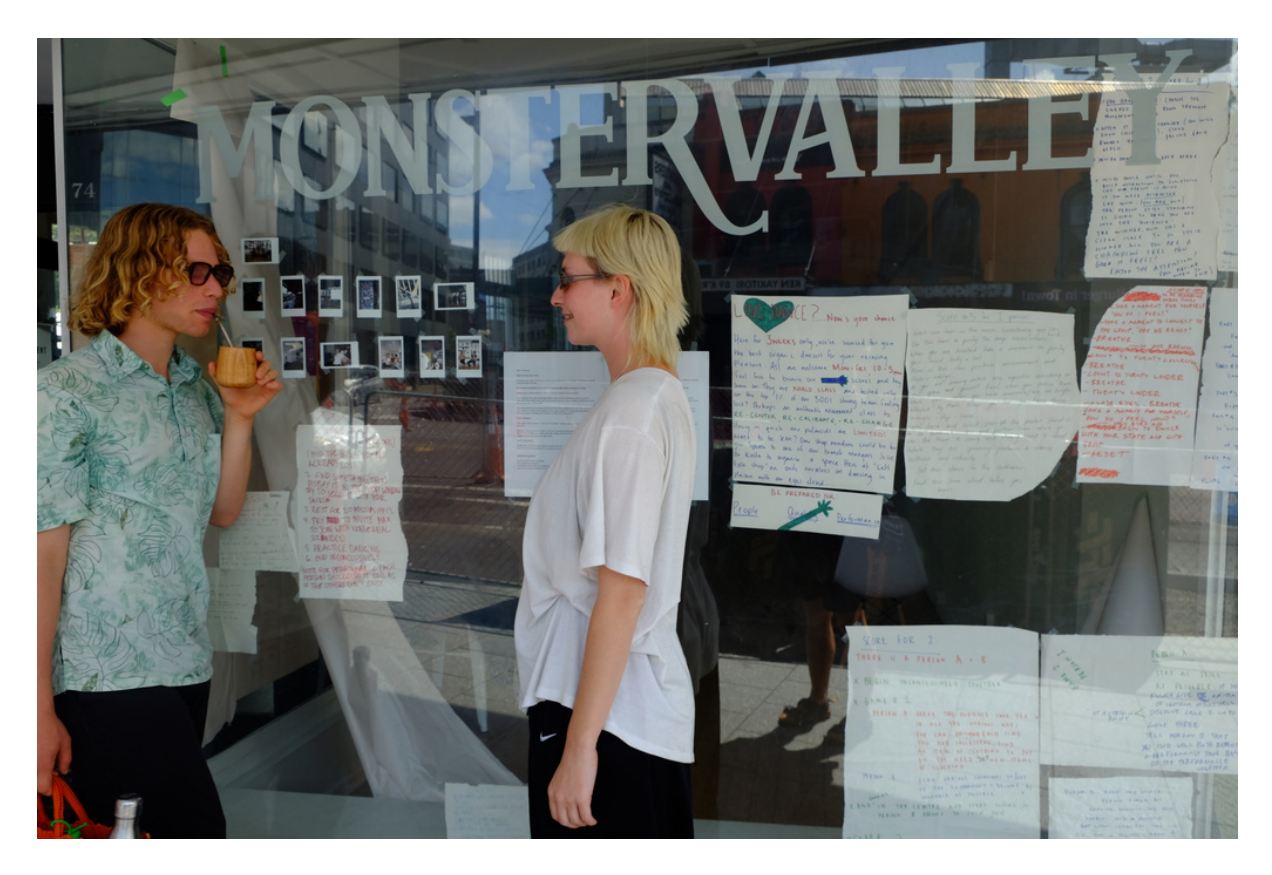
All are welcome MON - FRI, 10 - 5pm. Feel free to browse our scores and try some on.