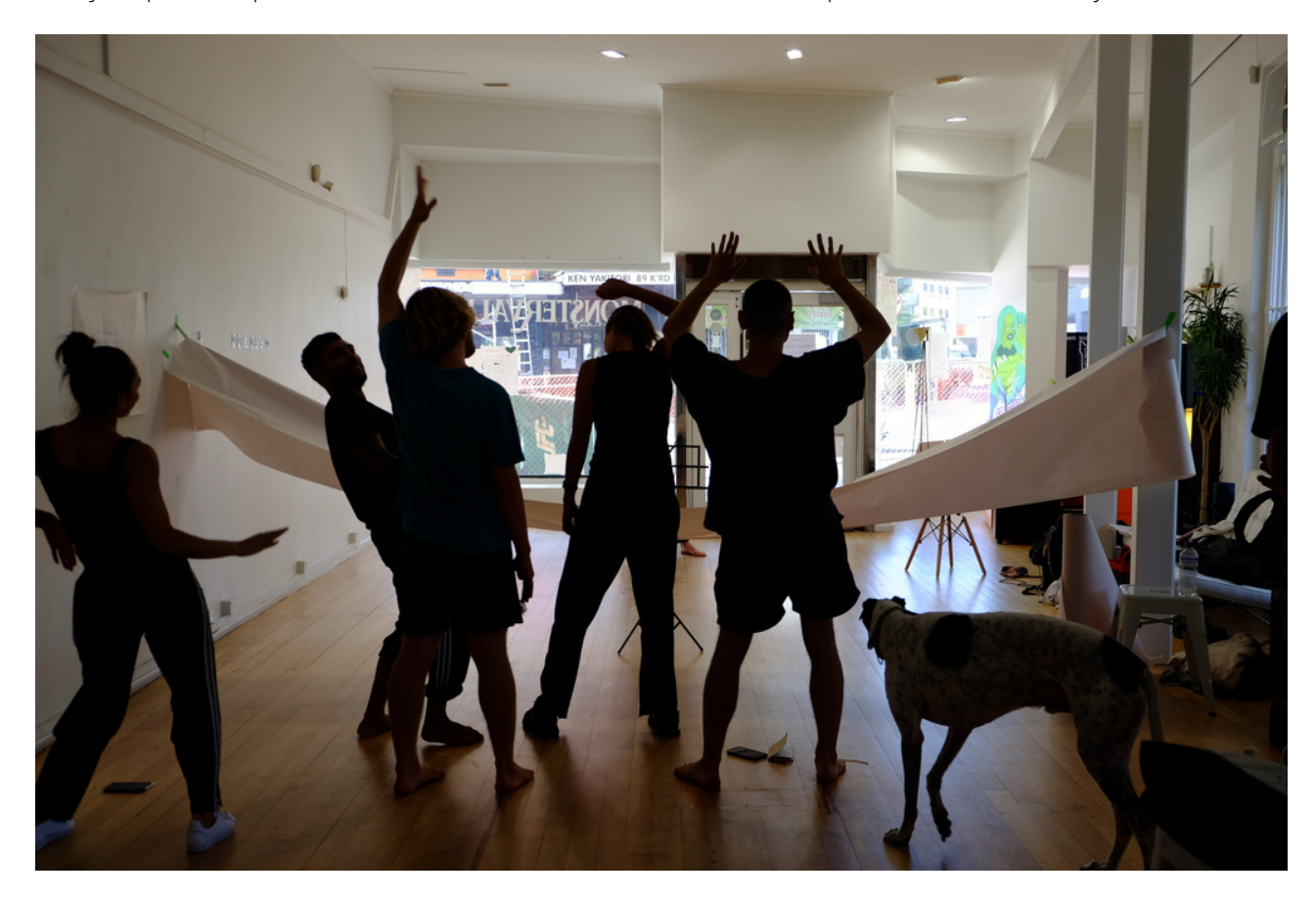
Here at 'Let's Talk Shop' we pride ourselves on dancing in unison with our eyes closed.

'Let's talk shop' 1-19 March 2021 Monster Valley, 74 Karangahape Rd, Auckland CBD