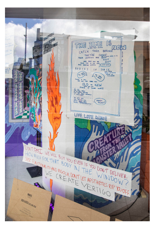
Hurry in quick our polaroids are LIMITED! Want to be seen? Our shop window could be for you.